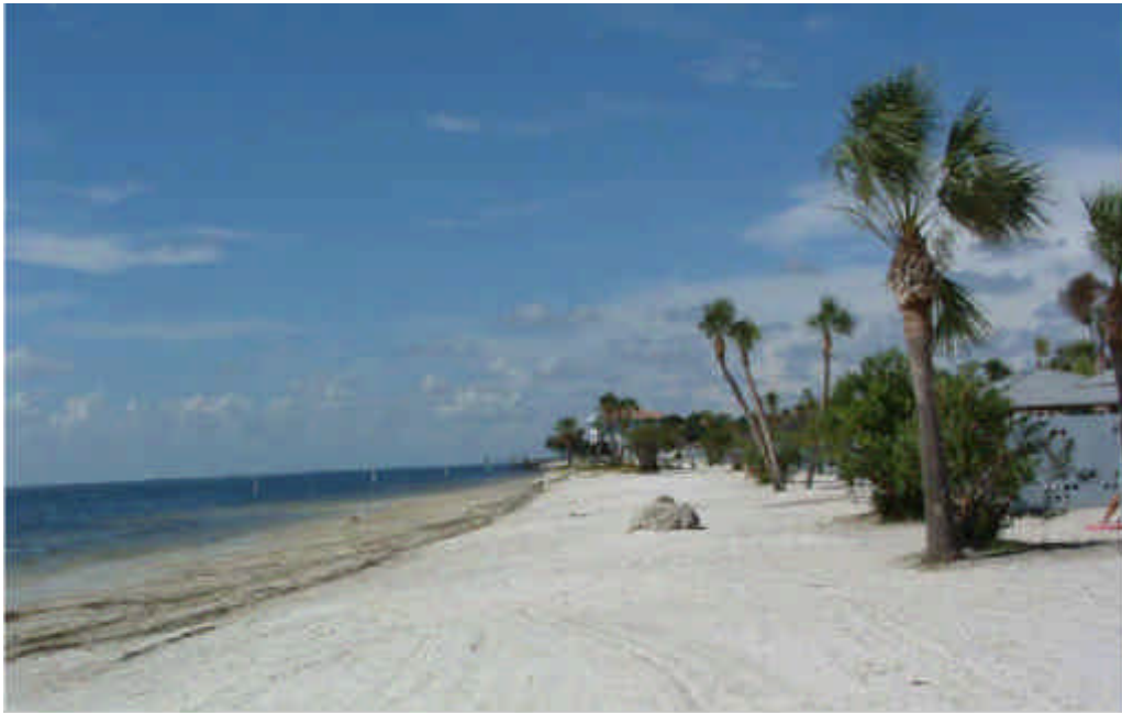
Gulf Harbors' Own Gated Private Beach on the Gulf – just down the street from your Dory's Landing vacation home!